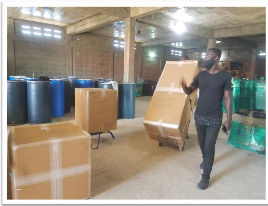
An employee of KG & Don's Express Shipping supervising the removal of the Elmina Methodist JHS' computer shipment from the storage facility in Kasoa, Ghana